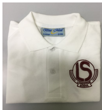
A Longstone Polo Shirt