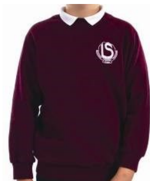
A Longstone Sweatshirt